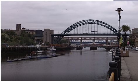
Above: Newcastle upon Tyne