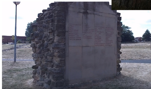
Admiral Lord Collingwood, Tynemouth