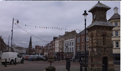
Above: Tynemouth Town Centre Left: Tynemouth Castle and Priory