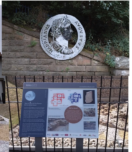
Roman Ruins, Wallsend